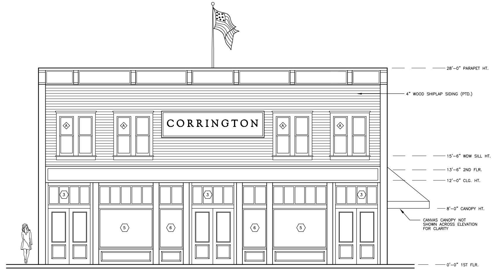
A PHASE 2- 6TH AVE. ELEV. SCALE: 1/4" = 1'-0" D:\CAD\0314