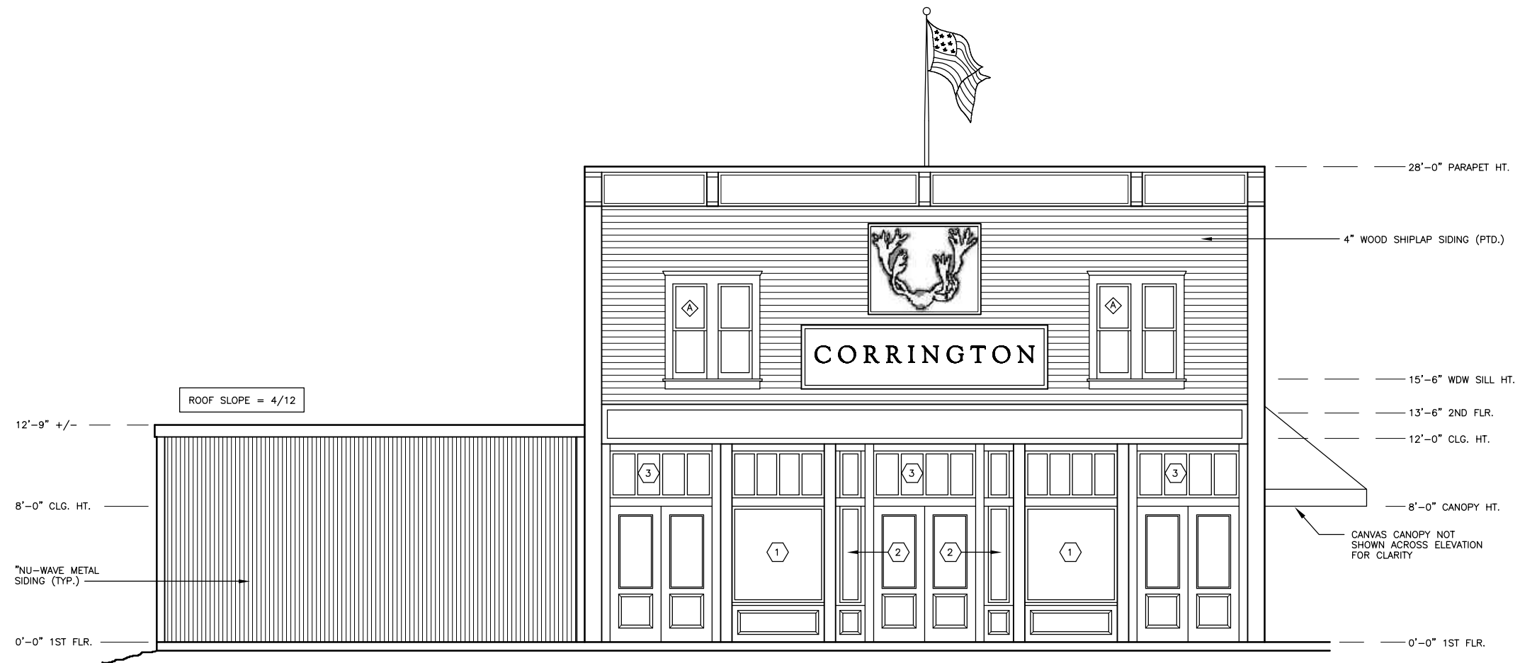
A PHASE 1 – BROADWAY ELEV. SCALE: 1/4" = 1'-0" D:\CAD\0314